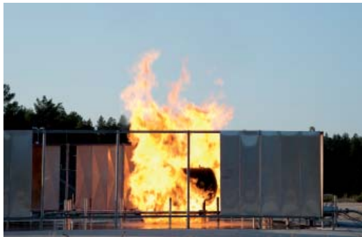
Fig. 5 Fire testing of a 2700 l tank

A test field with two fire test stands and infrastructure enables research and testing of the internal and external thermal load bearing capacity of containment systems for dangerous goods. Both test stands have a shielded test area of 12 m x 8 m. One test stand is designed for non-destructive testing of objects with masses of up to 200 tons. The other test stand is suited for destructive tests of objects with up to 20 tons. The caloric input is adjustable.