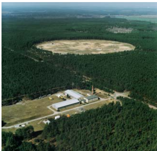
Fig. 1 Aerial view of part of BAM Test site Technical Safety

Nano is a buzz word in current research. Industrial safety is addressing nanotechnology, but it also addresses established technologies. They require an infrastructure for large scale testing. The necessity for large scale testing originates in the production facilities and the use of dangerous substances. These may be fuels, chemicals for industrial processes, explosives for mining and demolition. It is also associated with the transport and storage of dangerous substances and the fire behavior of constructions as well as the scale of potential damage to large structures.