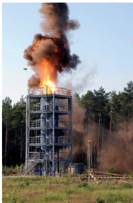
Fig. 4 Dust explosion in a test silo

Dust explosions are a pertinent risk in agricultural industries (grain processing, saw mills) and in the chemical industry. BAM investigates dust explosions with respect to numeric modeling under the particular influence of turbulences in silos. The silo can also be used to investigate safety devices such as flame arrestors and fittings.