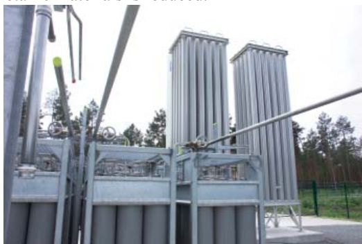
Fig. 2 Oxygen test facility

Oxygen is a very reactive gas and constitutes especially when enriched beyond the atmospheric conditions or pressurized an increased risk, as combustion velocity and burning temperatures are increased while the ignition temperature of non metallic materials is reduced.