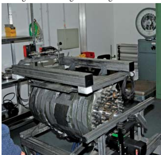
Fig. 3 Autoclave for acetylene testing

Acetylene is most commonly used in organic synthesis. Particular attention, however, is given to the safety of acetylene cylinders and acetylene use for autogenous welding and cutting.