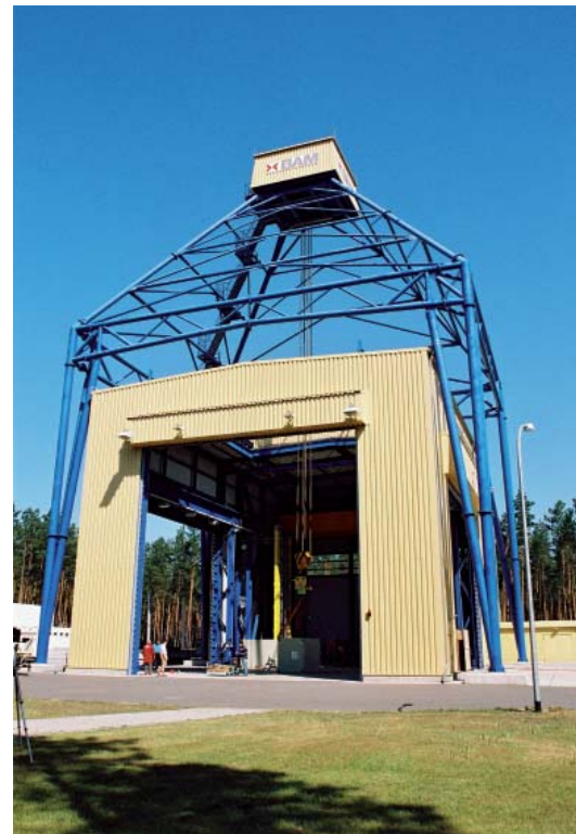
Fig. 6 Large drop test facility

demanded for drop tests in the regulations for the approval of containers.