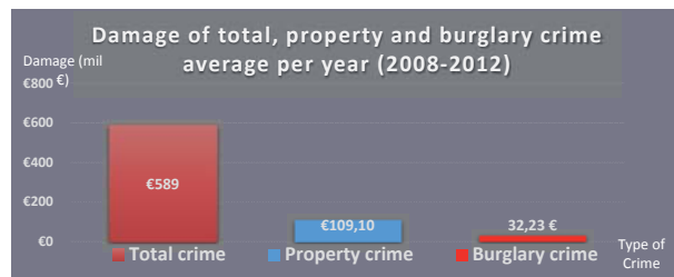
Fig. 2 Damage of total, property and burglary crime (average per year) in years in 2008 to 2012 (Ministry of Interior of Slovak Republic, 2013)

From the perspective of the protection of property against property crime theft we will focus on the terminology terms like offender, theft, burglary or intruder and other terms of the for a better orientation in this area.