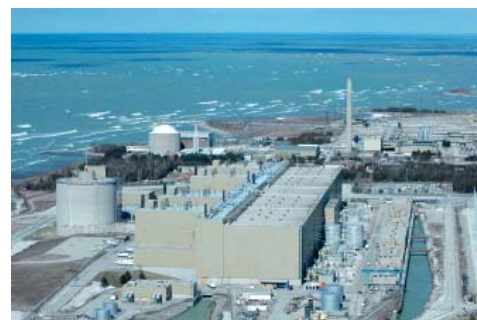
Fig. 2 Nuclear power plant Bruce, second generation type Candu from 1977

The process of converting energy in nuclear power plants can be divided into 3 stages. It applies to each generation of nuclear power plant. These stages are: converting the energy of splitting of the atom nuclei into thermal energy, converting the energy into mechanical energy and the last stage is converting mechanical energy into electricity (Ackerman, 1987).