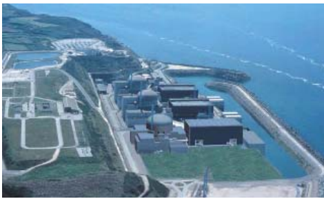
Fig. 3 Nuclear power plant Flammanville, Power plant EPR third generation from 1986