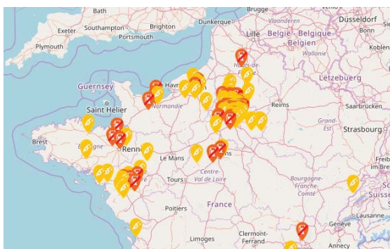
Fig. 1 Map of „affected” petrol stations and refineries. (Mosier, 2017)

„Advice to motorists around France was to stick to usual refuelling routines: I'd say if you don't plan to run your car any more than usual for the next week or two, then there should be no problem. If you're planning a long trip or need your car more than usual, then you probably need to make sure you have enough.“ (Mosier, 2017)