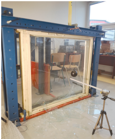
Fig. 3 Wooden window in the test frame

Another significant device was a high-speed camera (FASTEC TS31000SC4256 Imaging), which was used to examine the speed of the incident ball based on slow motion. The high-speed camera has a resolution of 1280 x 1024 and 725 frame per second. It has a multimedia display and 4 hour battery life. The measurement scheme and the location of the devices are shown below (Fig. 4).