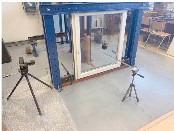
Fig. 4 Arrangement of the sample and the measuring instruments

During the experiment, 3 windows with a wooden frame and 1 with a PVC frame were used. Various sizes of steel ball (2.644 kg and 4.571 kg) were used in the test, which gradually started from defined distances. Each measurement was recorded with a high-speed camera and an accelerometer sensor. Individual drop heights were increased until the glass panel was damaged. Subsequently, the total impact energy values were evaluated. These values were calculated according to equation (1) using slow-motion recordings from a high-speed camera: