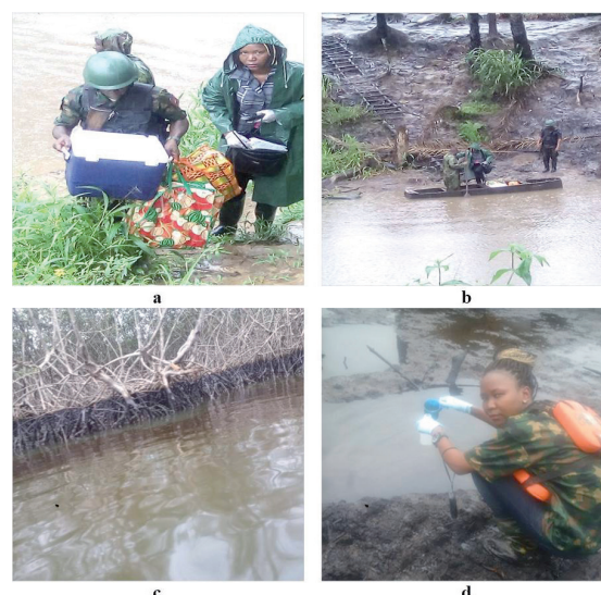
Fig. 1 Arrival at Study Area

Crude oil was found in makeshift reservoirs. Waste discharge from the 'fractionation column' was found in the waste pit dug into the ground. On reaching the site it was found empty with the crude oil reservoir abandoned. A layer of oil was observed covering the soil and water ways, indicating illegal refining activity as an anthropogenic source of contamination of the area. Soil and water sampling were drawn randomly onsite. Control samples were also taken from the nearest uncontaminated farmlands.